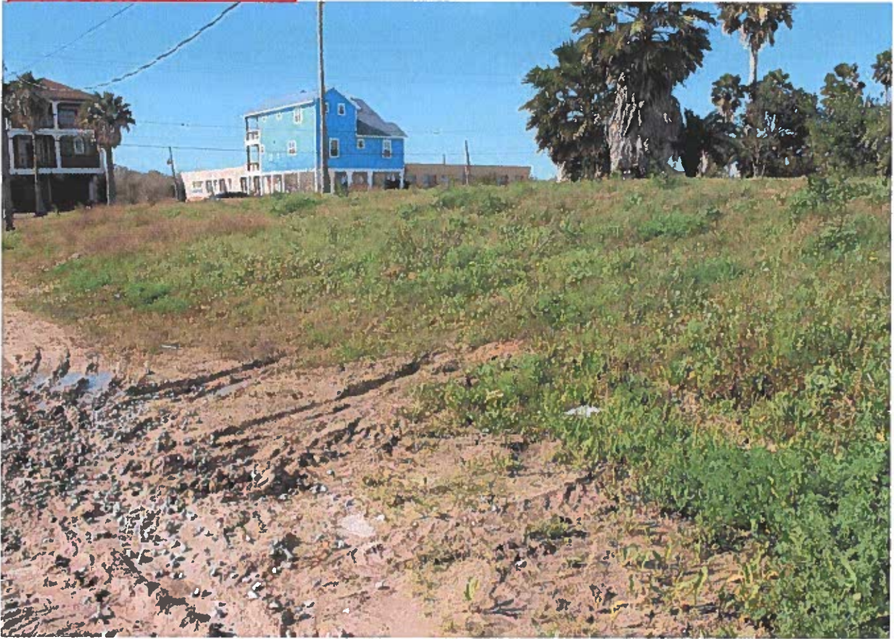
High grass and weeds before contract mow